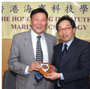
Hon. President & Chairman of HKIMT