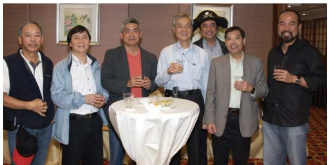
Group photo among friends