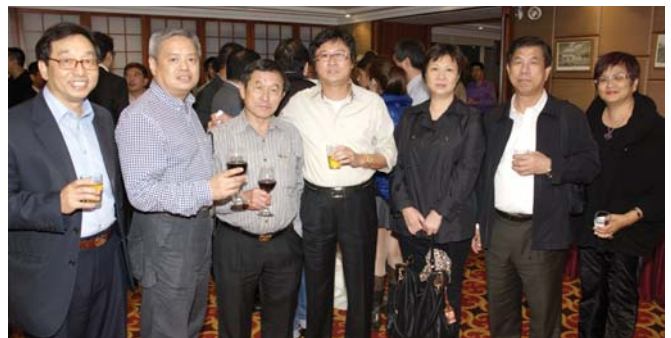
Group photo from friends