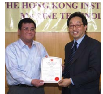
Presentation of membership certificate