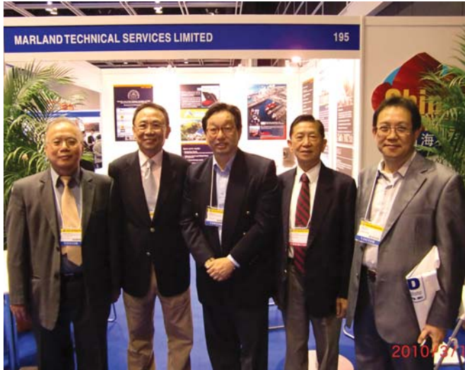
Visiting team members with senior management of Marland Group

Some HKJB/HKIMT member did visit the exhibition and was well received by the chairman of Marland Group.