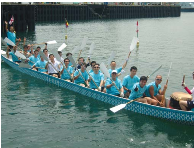
Cheering from the paddlers