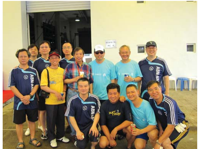
Good memory from the racing team