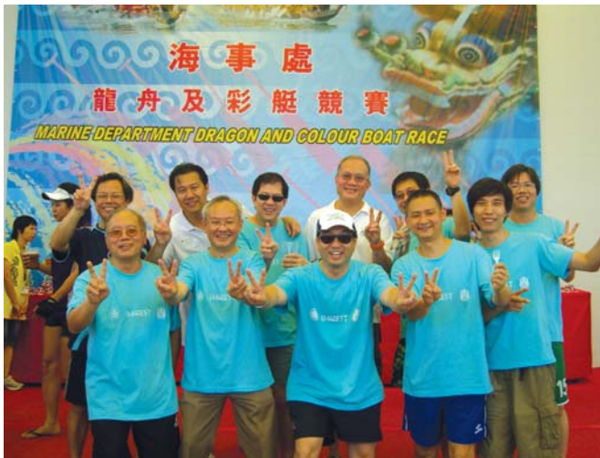
Cheering up photo before the race