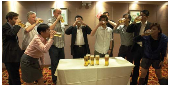
Beer drinking contest